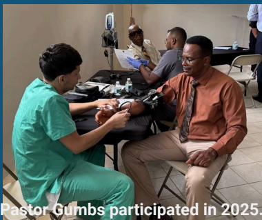
Pastor Gumbs participated in 2025.

This mini health fair provided a variety of free screenings and information to those who attended, including blood pressure, blood glucose, and hearing and vision tests.